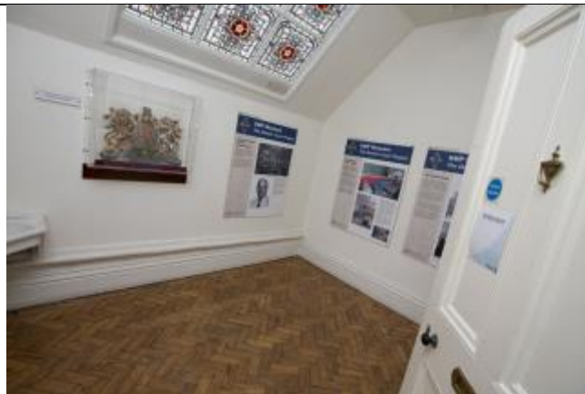
The Doctors room (First floor)

This is a small room with information about the Court Room.