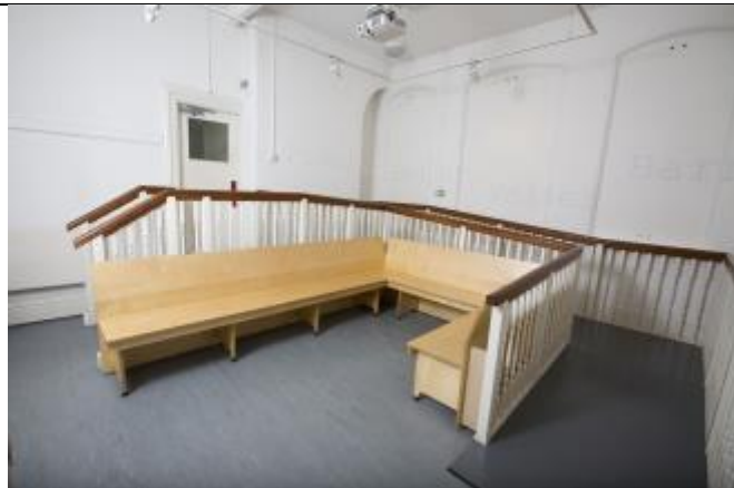
Audio Visual room (First floor)

In here visitors can sit and watch films about policing.