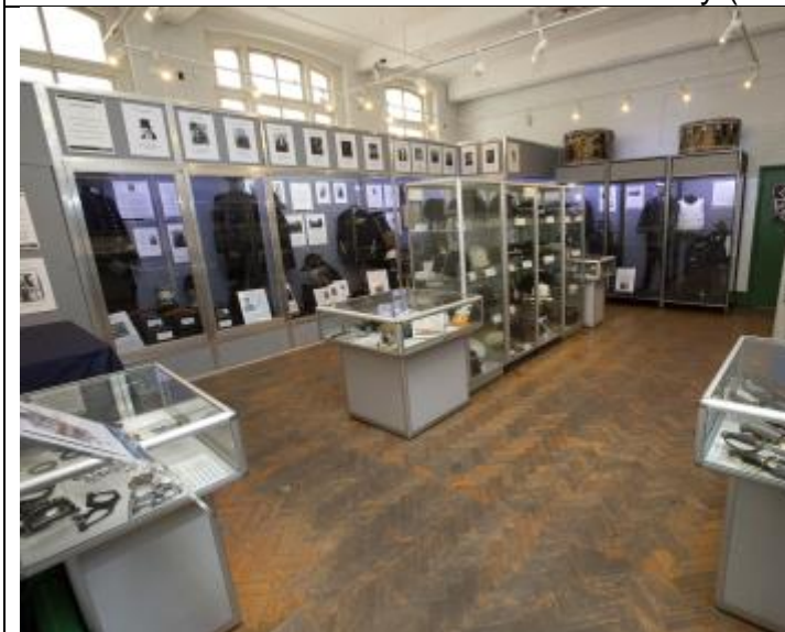
Uniform Gallery (Ground floor)

The Uniform Gallery shows police Uniforms & hats from the past.